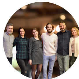
LA CITÉ ELDERSHIP TEAM