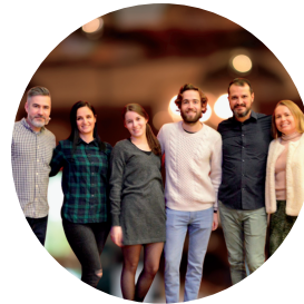
LA CITÉ ELDERSHIP TEAM